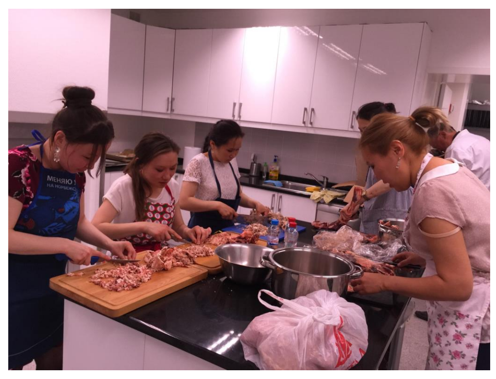
Pic: EALLU team of reindeer youth preparing traditional foods at the Norwegian Embassy Reception in Moscow. ICR, 2016.

Concerning other activities, the Centre has achieved much within the main goals of the Centre, with limited resources. Several of these activities and initiatives have shown strategic potential for the Centre, and have had significant positive impact on other operations, projects and initiatives of the Centre.