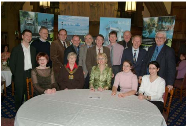
Interreg IIIB Canal Link partner meeting in Leeds in Feb. 05

The focus of our work towards the 53 municipalities in the BTV region were to promote and develop EU program project participation. We arranged 7 seminars with more than 1000 participants which provided information about EU programs and funding possibilities for projects which municipalities, schools and businesses could apply for. We also assisted these groups with project development. Some of the EU projects which the BTV municipalities participated in during this period are: