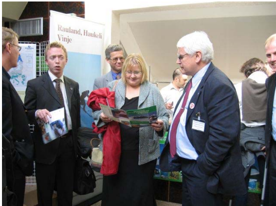
Norwegian Minister for Regional Development and Local Affairs Erna Solberg studies the leaflet 'Mountain Region Cooperation in Norway'.

BTV mountain regions have benefitted from being members in this organization as more emphasis has been placed regionally, nationally and at an EU level on regional development issues in mountain regions. Attendance at the annual general assembly by BTV politicians and bureaucrats, and project development such as participation in the Interreg IIC Euromountains.net project, a national initiative Mountain Region Cooperation and influence on the EU to develop a green paper for mountain regions, and for national governments to put more focus on mountain regions has been an active goal of participation in this organization.