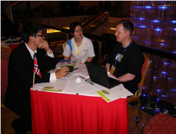
Chinese and Norwegian businesses in dialog under Norway-Hubei Week, June 07, Wuhan (China).

BTVs international team cooperated with the BTV business development team in working towards internationalization in businesses throughout the BTV region. This included cooperation with Innovation Norway and arranging several seminars on themes which promoted international development in BTV companies by linking up actors to relevant organizations, persons, initiatives in focused areas through activities such as: The Annual Scandinavian Triangle Maritime Partenariate, meeting series in cooperation with Innovation Norway, cooperation with Vestfold's Kaunas, Lithuania office, links to EU programs and existing projects with business development opportunities and participation at Norway-Hubei Week in China and visits from Chinese delegations from Hubei to BTV businesses.