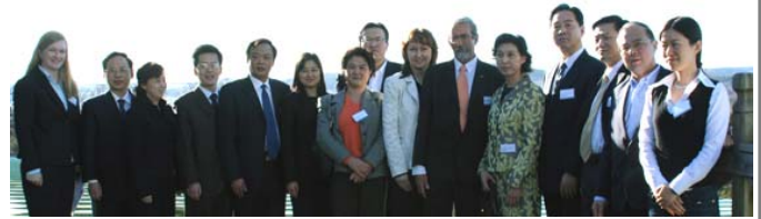
A delegation from Hubei Province in China were hosted by Telemark Mayor Gunn Marit Helgesen and attended the Maritime Partenariat in Uddevalla, Sweden on March 21-22, 2007.

The County Administrations of Buskerud – Telemark - Vestfold have cooperation agreements with the following foreign regions: