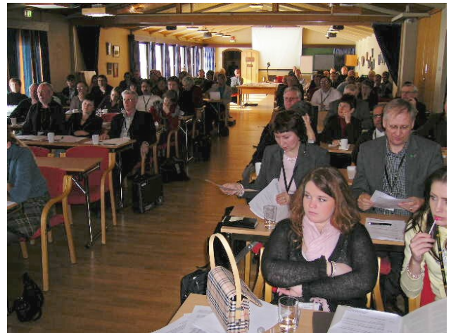
BTV seminar participants learn more about participation in international projects held on March 14, 2006 in Morgedal.