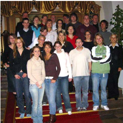
30 youth from 10 countries participate at the 13 th annual BSSSC conference held in Szczecin, Poland on Oct. 20-22, 2005.