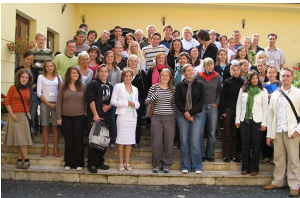
Participants at the AER Youth Summer School 2006 in Baia Mare, Romania

The focus of our work towards the youth in the BTV region was working together with the youth councils and promoting participation in two new European political arenas in Europe: