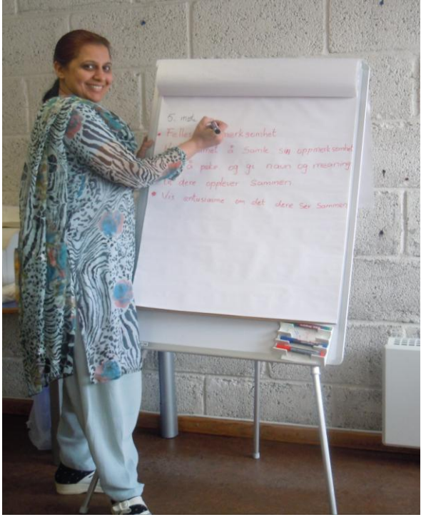
Picture 1 and 2: Facilitators in the minority version of the ICDP teaching and role playing